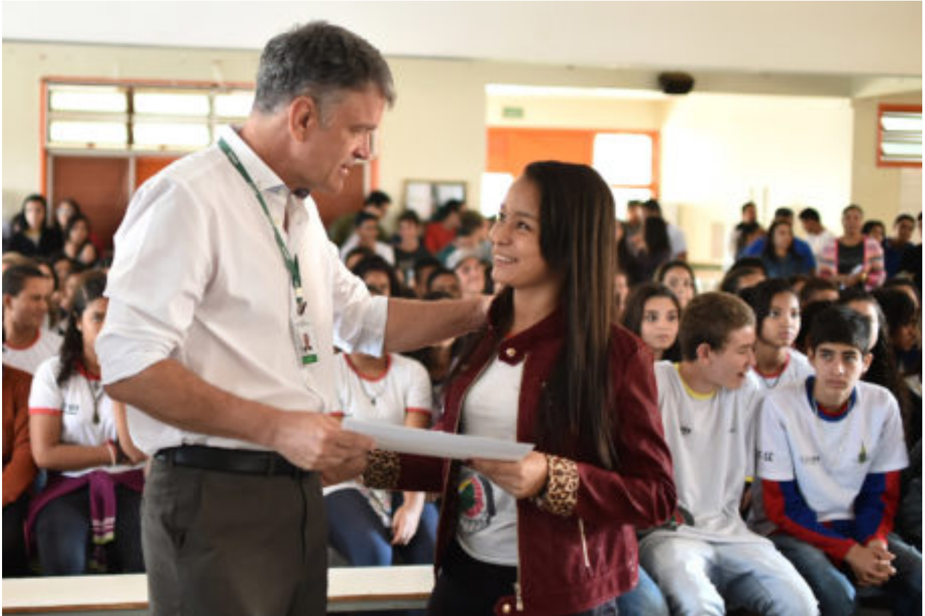
Figure 1: The winners of the civic audit received a certificate from the Comptroller-General, Henrique Ziller